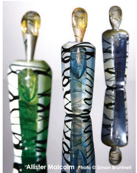
Allister Malcolm