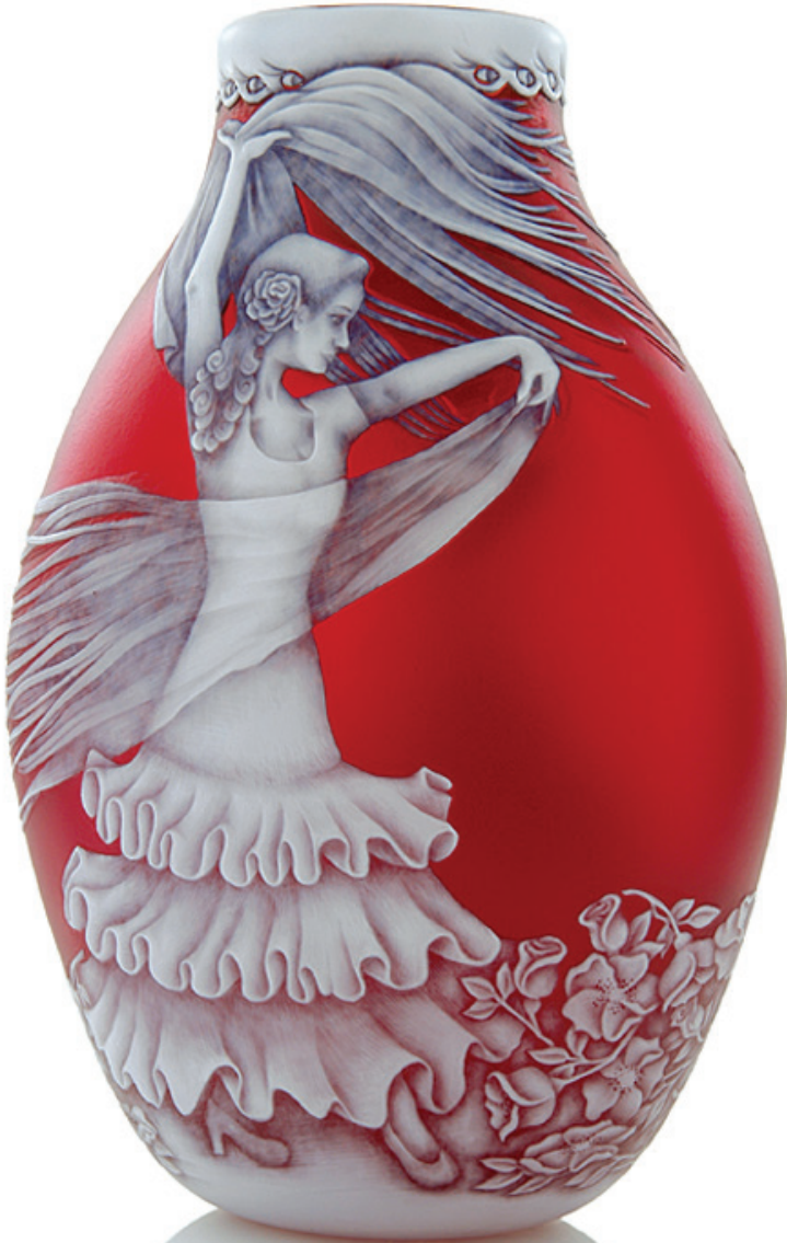
Flamenco Dancer Cameo Ruby with blue overlay, then white overlay